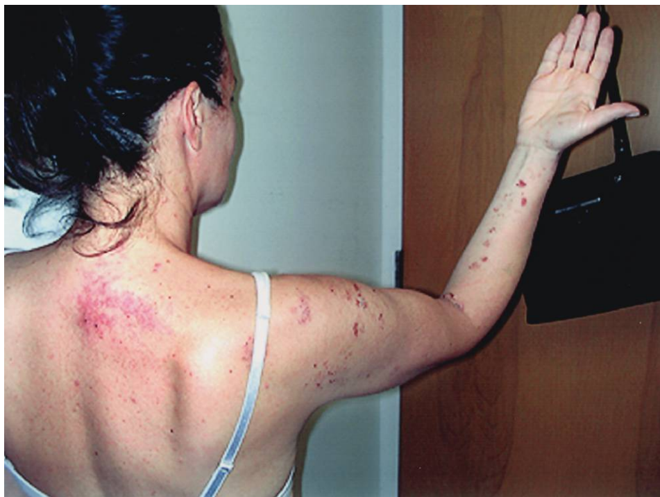
Figure 3. Cervical herpes zoster

In the immunocompetent patient with HZ, there are nu-