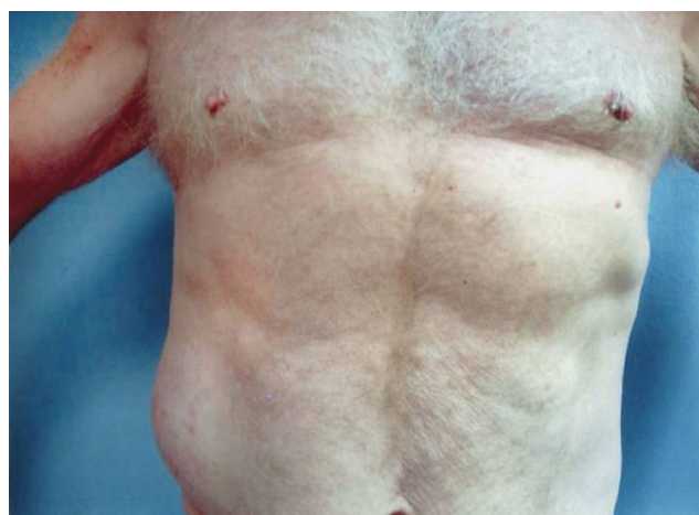
Figure 5. T8 motor neuropathy in an otherwise healthy 59-year-old man who presented with vesicles in the T8 distribution 4 weeks before this photo was taken. The patient was treated with an antiviral agent for 7 days and with analgesics as needed. As the rash resolved, this bulge became apparent; it is consistent with motor damage by varicella-zoster virus to the muscles of the abdomen.

Second cases of HZ are uncommon in immunologically intact hosts, presumably because an episode of HZ will boost immunity and thereby prevent subsequent symptomatic VZV reactivations. The available data suggest that second cases of HZ occur in \leq 5\% of individuals, although this conclusion is limited by the duration of follow-up, uncertainty of the di-