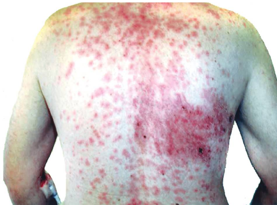
Figure 6. Disseminated herpes zoster

agnoses, and incomplete information about comorbid disease [32–34].