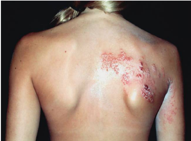
Figure 2. Thoracic herpes zoster

The rash associated with HZ has a brief erythematous and macular phase, which is often missed, after which papules rapidly appear. These papules develop into vesicles within 1–2 days, and vesicles continue to appear for 3–4 days. At this point, lesions of all types may be present (see figures 2–4). The lesions tend to be grouped, and clusters are often seen where there are branches of the cutaneous sensory nerve (e.g., in parasternal, mid-axillary, and paraspinous areas, representing the anterior and lateral branches of the anterior primary division as well as the posterior division of a thoracic nerve). Pustulation of ves-