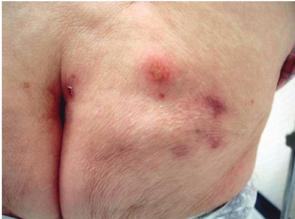
Figure 7. Zosteriform herpes simplex in an elderly woman who presented with what she called “her recurrent shingles.” Vesicles in a lumbosacral distribution had recurred many times over the past several years, and this outbreak began 1 week before the photo was taken. A viral culture demonstrated herpes simplex virus type 2. The patient was otherwise healthy, except for hypertension.

of a similar rash in the same distribution (to rule out recurrent zosteriform herpes simplex; see figure 7); and (6) pain and allodynia in the area of the rash. Allodynia, which is common in both HZ and PHN, is pain evoked by a stimulus that does not normally cause pain—for example, light brushing of the affected area with a cotton swab.